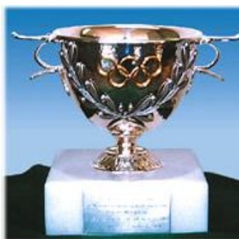
Former President of the IOC donated the IOC President's Cup to the Champion

長野奧林匹克紀念長野馬拉松大會使我們想起 1998 年舉行的長野冬季奧運會時的感動，為地區運動，發展文化以及 Olympic Movement 做出了貢獻，而且由於馬拉松一般參加者跟最高級別的國內和外國人選手一起跑，擴大馬拉松愛好者。長野奧林匹克紀念長野馬拉松大會跑道(42.195Km) 被稱為 “Nagano Olympic Memorial Course (長野奧林匹克紀念跑道)” 在跑道上馬拉松參加者能看到 1998 年舉行的長野冬季奧運會設施，終點是長野奧林匹克比賽場。